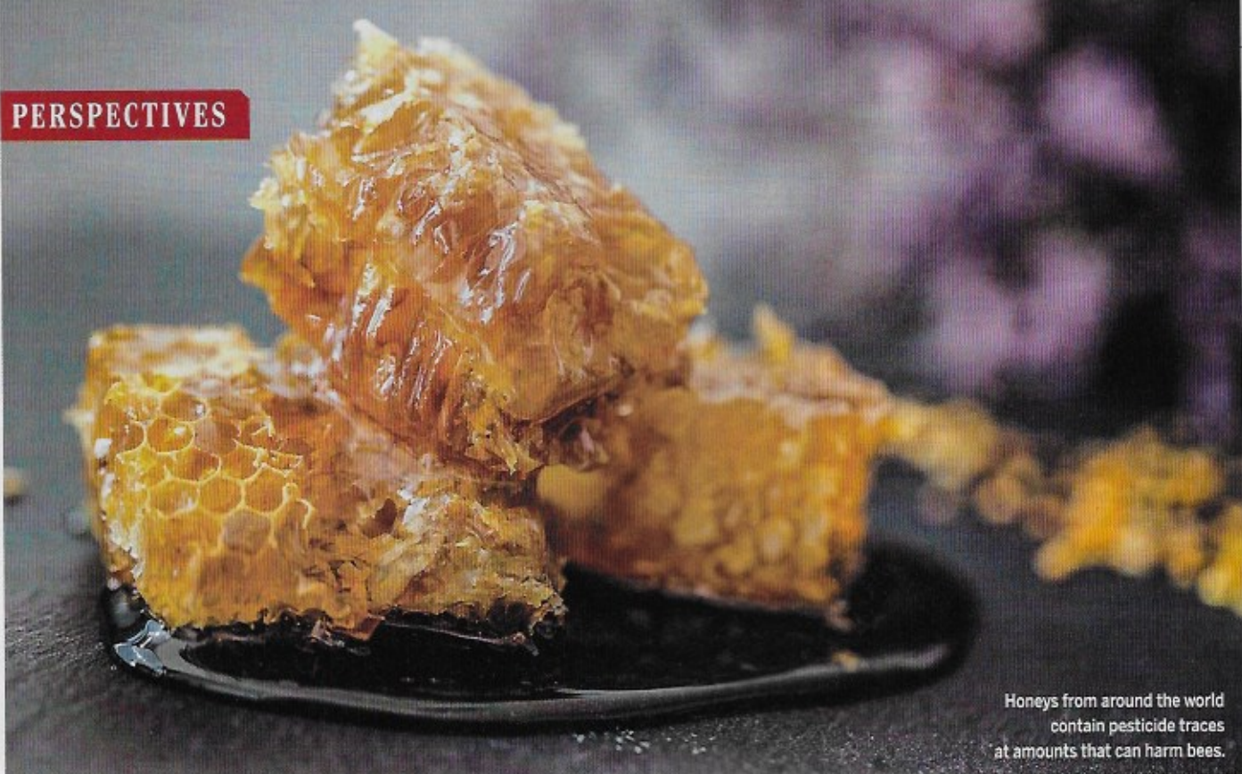
Honeys from around the world contain pesticide traces at amounts that can harm bees.